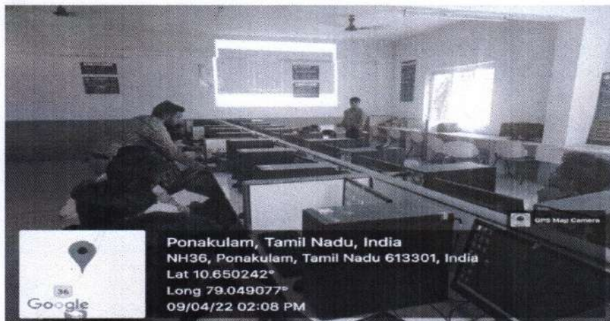
Resource person from M/s. Dolphin, Handling practical session.

Feedback from Trainers and the students were collected.